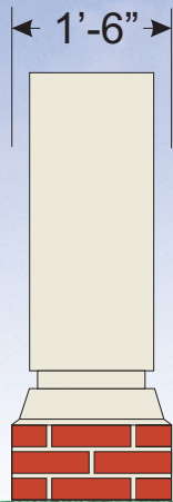
Front & Rear view